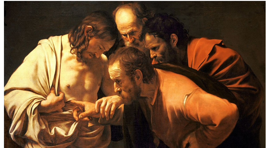
He showed unto them His Hands and His Side