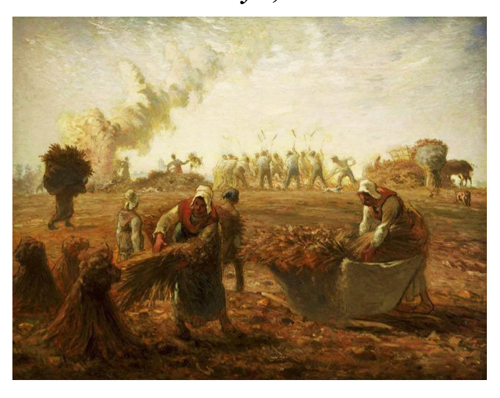
Parable of the Wheat and the Tares

Fifth Sunday after Epiphany February 6, 2022