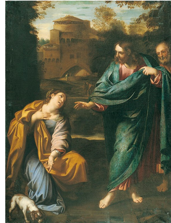
Jesus and the Canaanite woman

The Cathedral Church of St. Peter All Souls' Lane & Rochford Street Charlottetown, P.E.I., Canada, C1A 7L3 Office 902-566-2102 Rectorry 902-566-4457 The Second Sunday in Lent March 13, 2022