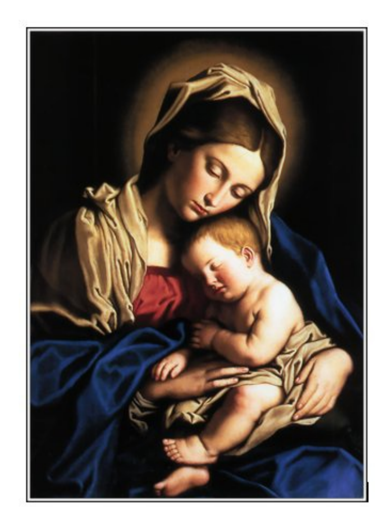
THE BLESSED VIRGIN MARY, THE MOTHER OF OUR LORD JESUS CHRIST

Please assist our sexton at the end of each service by picking up your kneeling cushion and placing it on the pew.