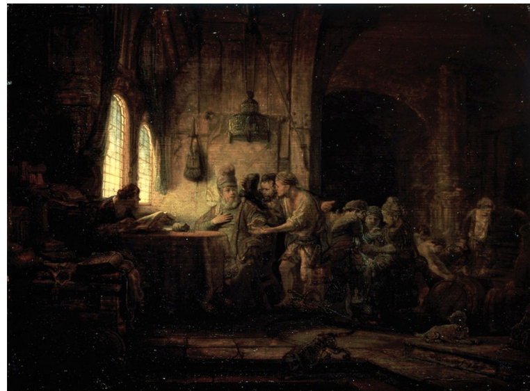
Parable of the Labourers in the vineyard