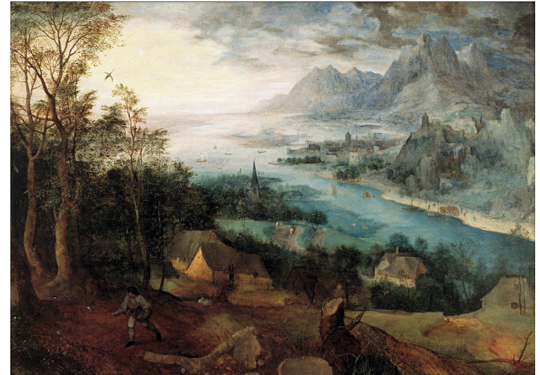
Parable of the Sower