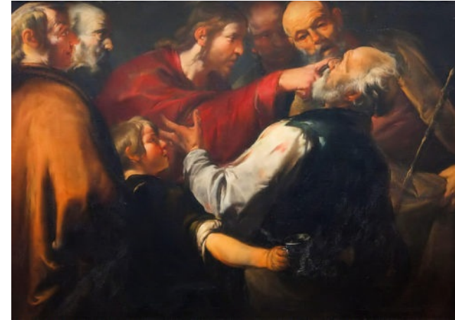
Jesus heals a man who is deaf (Mark 7)

The Twelfth Sunday after Trinity September 4, 2022